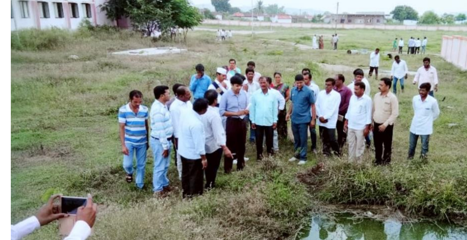
Before and after: Construction of community soak pit in water logging area