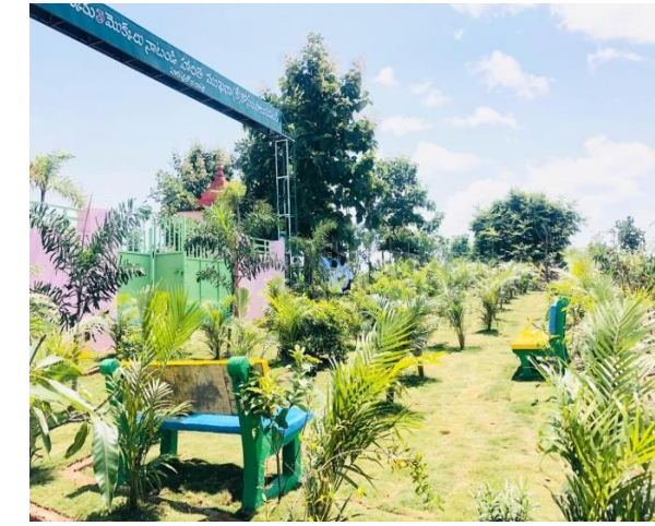
Village park – Palle prakruthi vanam