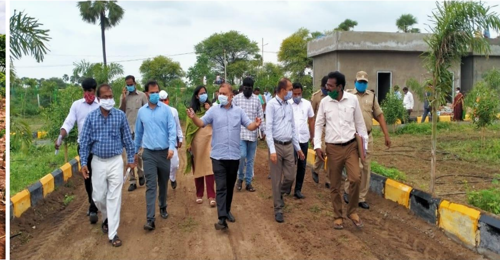
Awareness walks and shramadan during cleanliness activities