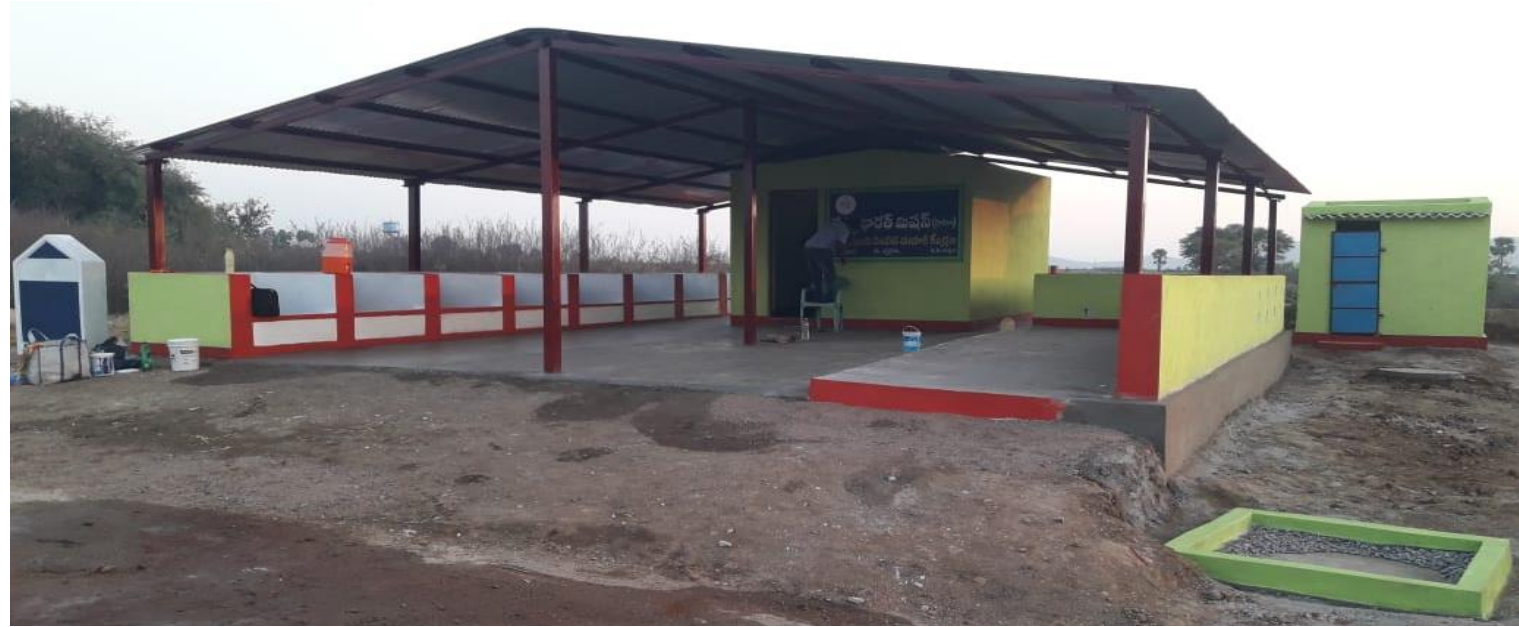
Segregation cum compost shed toilet