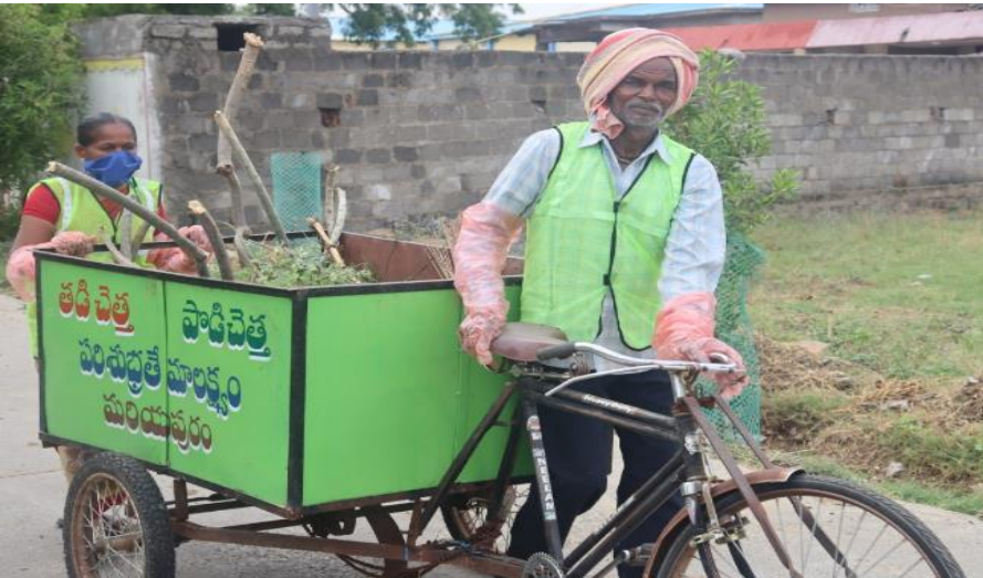
Processing @ segregation shed