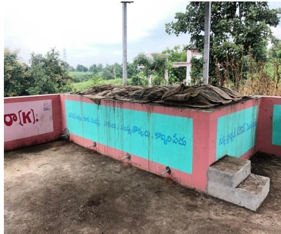
Wet waste composting units