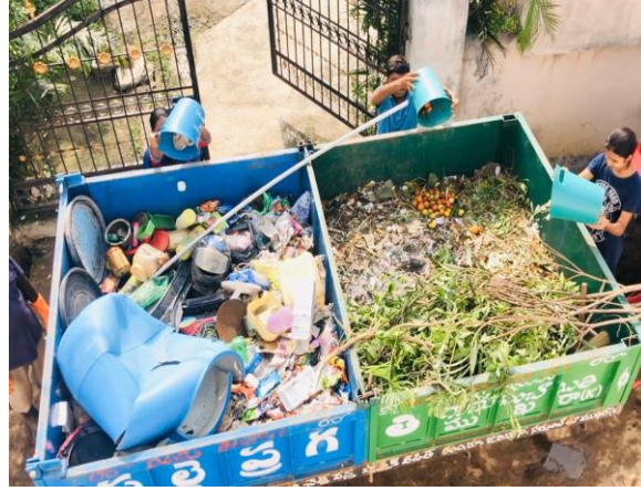
Segregated waste collection using tractors