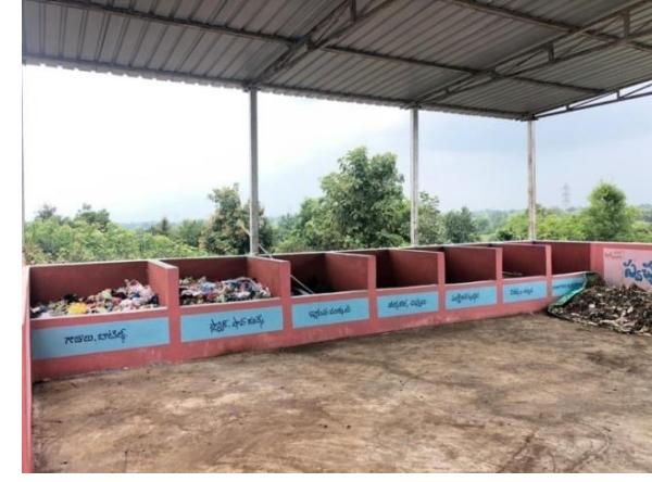
Sorting dry waste and storage units