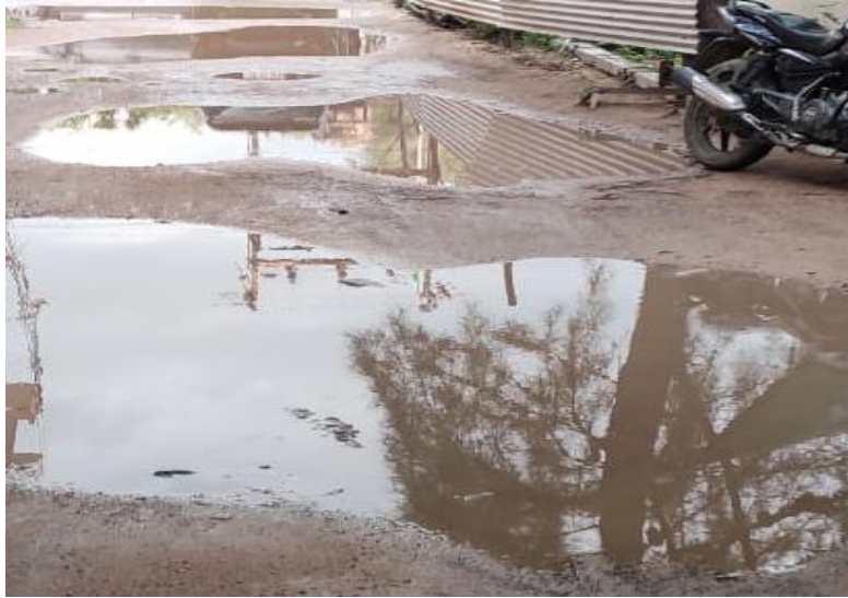
Before and After: filling pot holes, repairing roads, cleaning open common lots for public use