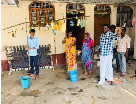
IPCC for source segregation