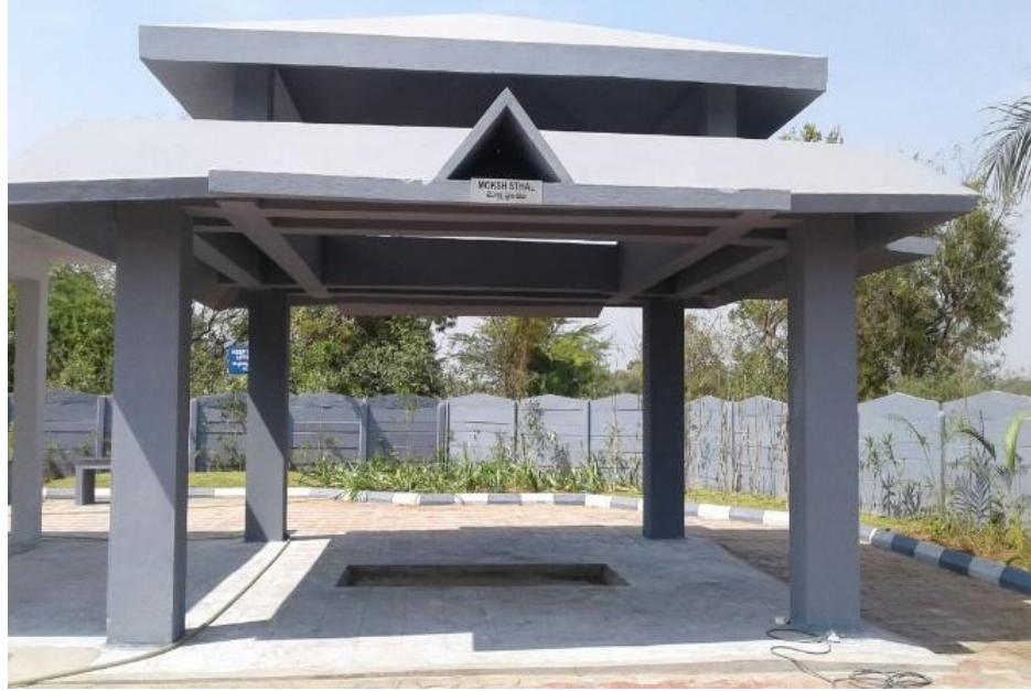
Crematorium with bath area and toilets