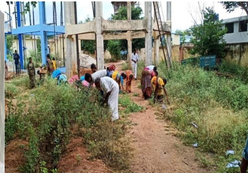
Before and after: Shramadan for cleaning public places, removing unwanted bushes and weed