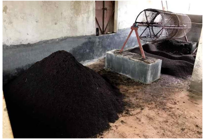
Disposal or Recycle