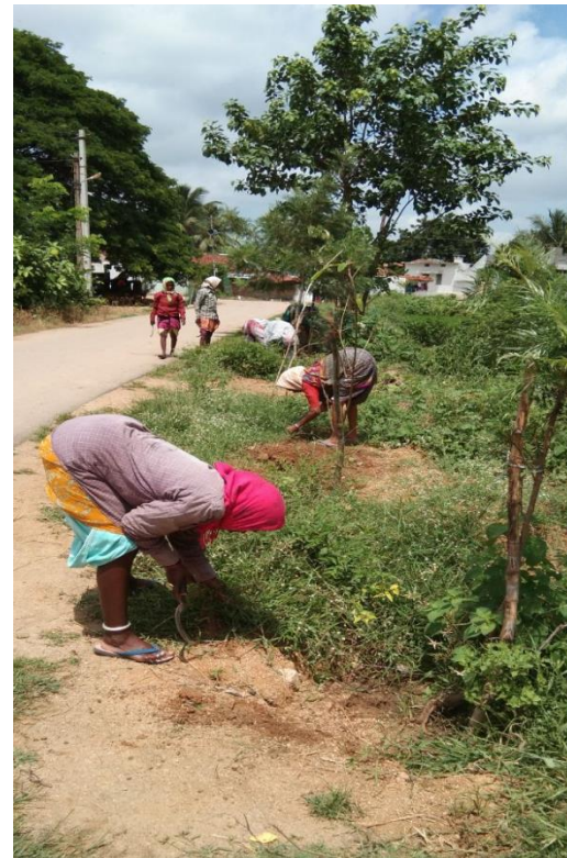
Before and after : Removing weeds and unwanted growth