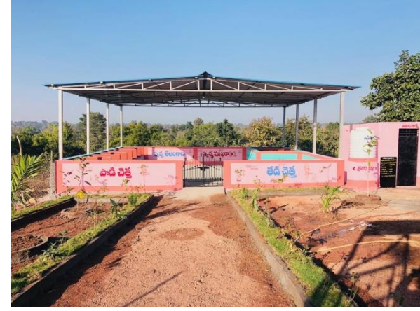
Segregation cum compost shed