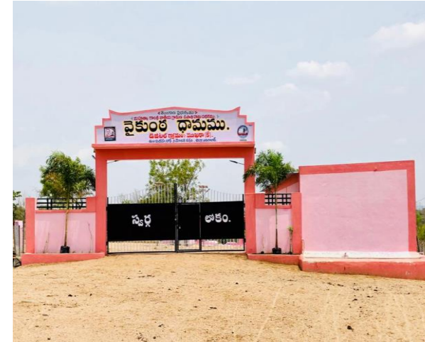
Crematorium - Vaikuntadhamam