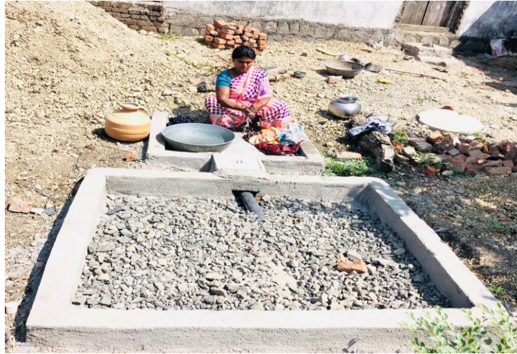
Magic soakpits construction