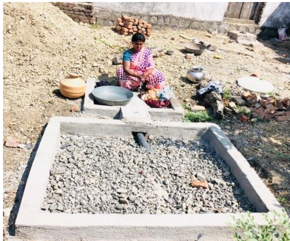
Individual magic soak pits